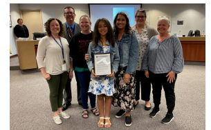
Frankfort Square Exemplary Student