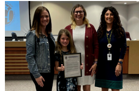
Indian Trail Exemplary Student