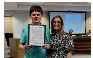
Summit Hill Jr. High Exemplary Student