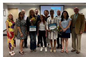
Summit Award Winners