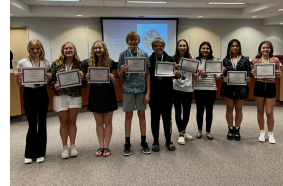
IJAS State Fair Winners

The Board of Education recognized the Summit Hill Junior High students who participated in the 2023 Illinois Junior Academy of Science State Fair in April. Our Spartans earned 14 gold medals, 11 silver medals, and two bronze medals.