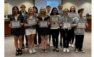
IJAS State Fair Winners